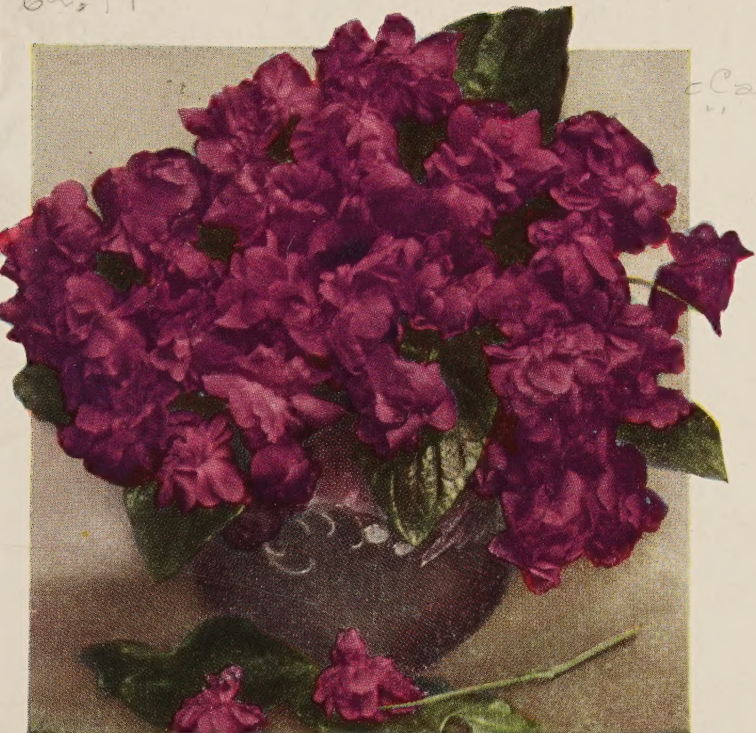
Double Russian Violets

Sec. 562, P. L. & R. U. S. POSTAGE PAID Permit No. 222 HOLLAND, MICH.